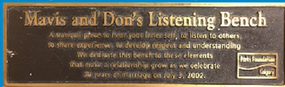
SAMPLE PLAQUE - REPLACED WITH NEW PLAQUE & UPDATED MESSAGE IN 2018

Calgary's parks and pathways have many stories to tell. Each and every one of Parks Foundation Calgary's 1200 dedication benches and tables carries a unique message that was crafted with care to share with everyone.