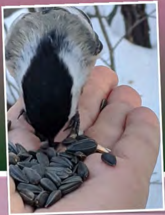
at Carburn Park

"If only the world was as trusting as the beautiful and delicate chickadee"