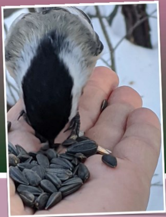
at Carburn Park

"If only the world was as trusting as the beautiful and delicate chickadee"