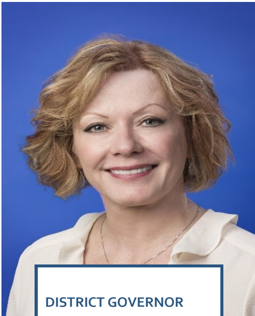
DISTRICT GOVERNOR CHRISTINE RENDELL

We - Rotary Members - are shaping Rotary's future. While the club remains the core of the Rotary experience, we are now far more creative and flexible in deciding what a club can be, how it can meet, and even what can be considered a Rotary meeting.