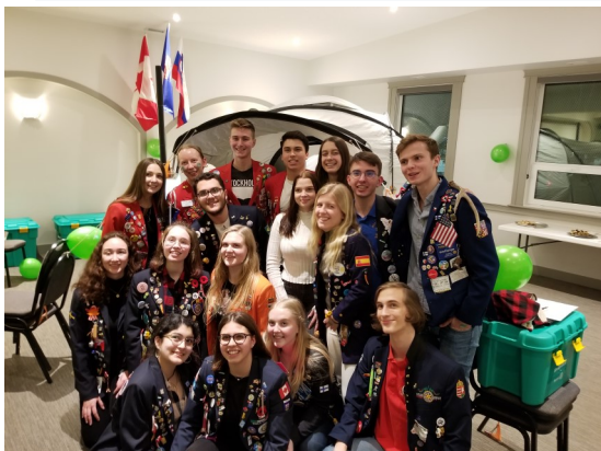
Rotex & Youth Exchange students joined to produce a successful International Dinner on January 24th at the Calgary Slovenia Club. Funds raised from the auction of aprons were donated to Shelterbox.