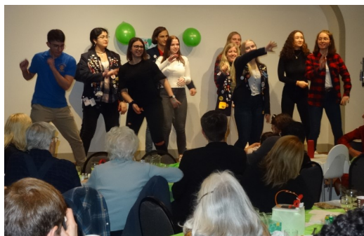
International Youth Exchange students entertain during a talent show.

ShelterBox responds to natural disasters by first understanding the impact of each emergency. Based on this analysis, it sends ShelterBoxes and ShelterKits with varied contents. ShelterBoxes can include solar lights, water storage and purification equipment, thermal blankets and cooking utensils. ShelterKits can include toolkits, ropes, and tarpaulins to make emergency shelters, repair buildings, or create new homes.