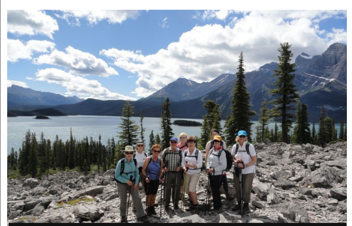
This group of nine journeyed to Lower Kananaskis Falls, here we are at the lower lake