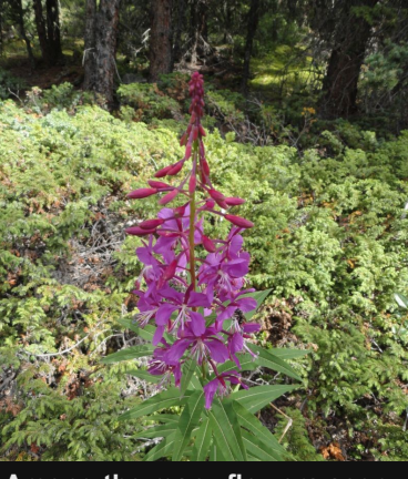
Among the many flowers seen was this lovely Fireweed