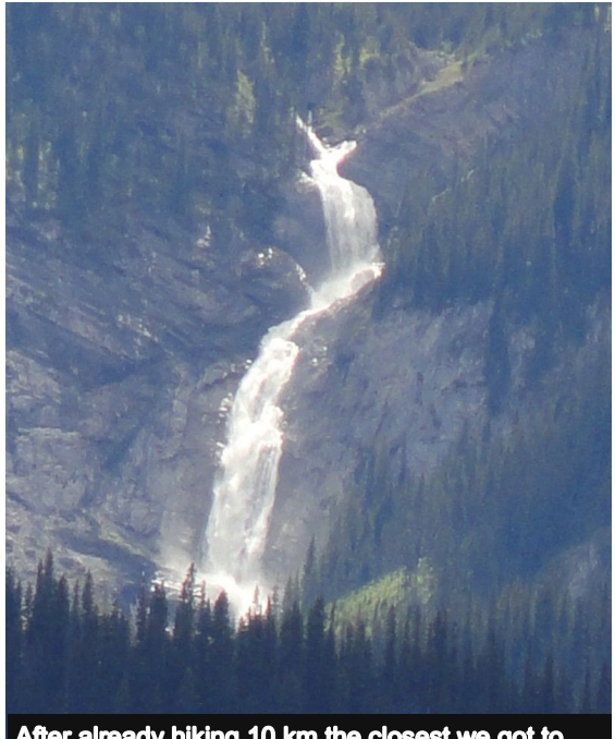
After already hiking 10 km the closest we got to this large waterfall was with a telephoto lens