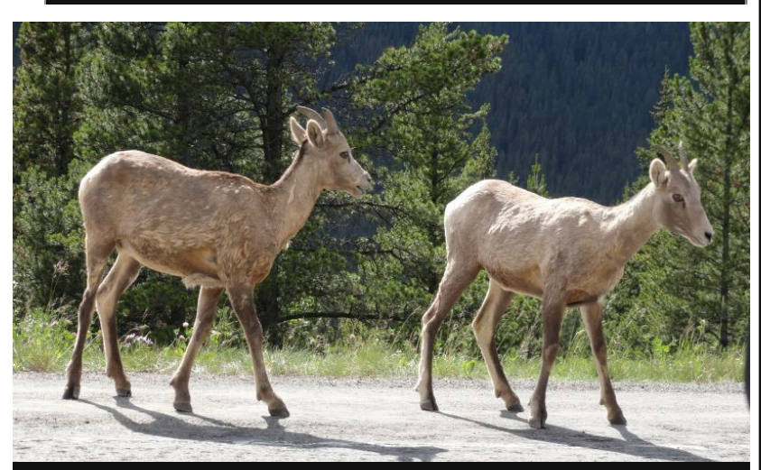
We were lucky to see these two young Rocky Mountain Sheep who stopped to pose. We were also lucky enough not to run into the Grizzly Bear that was spotted near where we were hiking!