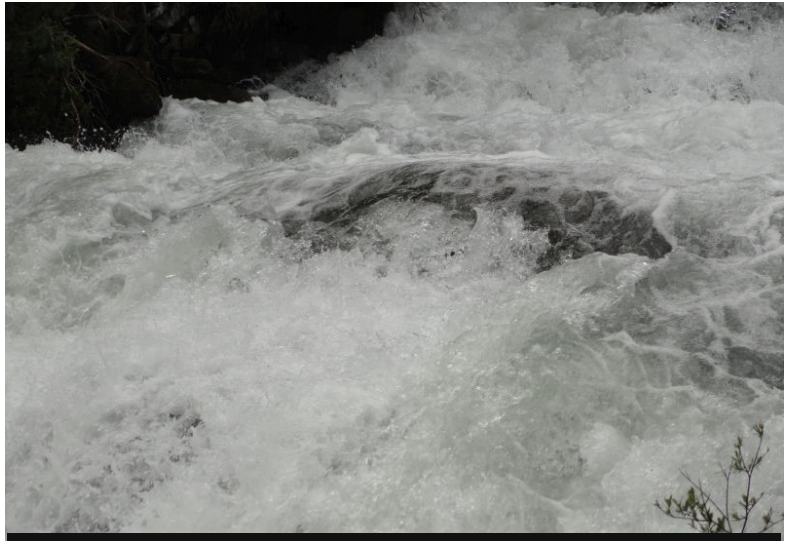
A close up of the swirling water picks up its powerful movement