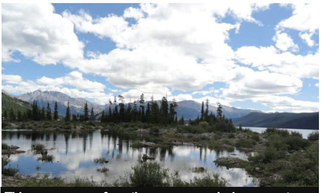
This scenery was from the campground where we ate lunch with a camper that joined us on our hike. He had pitched his tent and was staying alone