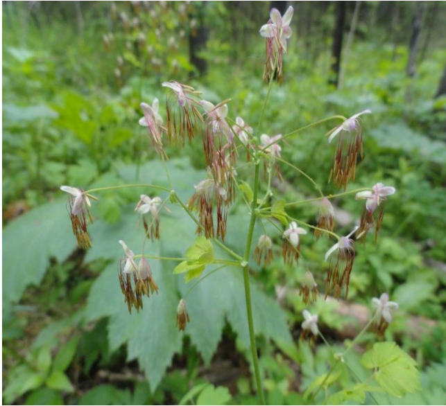
This strange looking flower is Western Meadowrue.