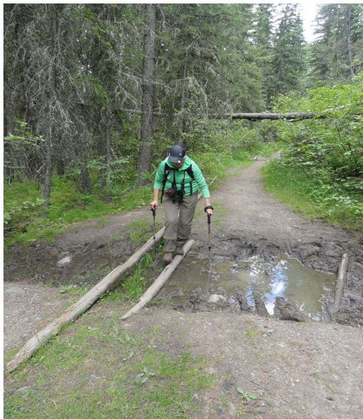
Some challenges were walking across the muck on a log.