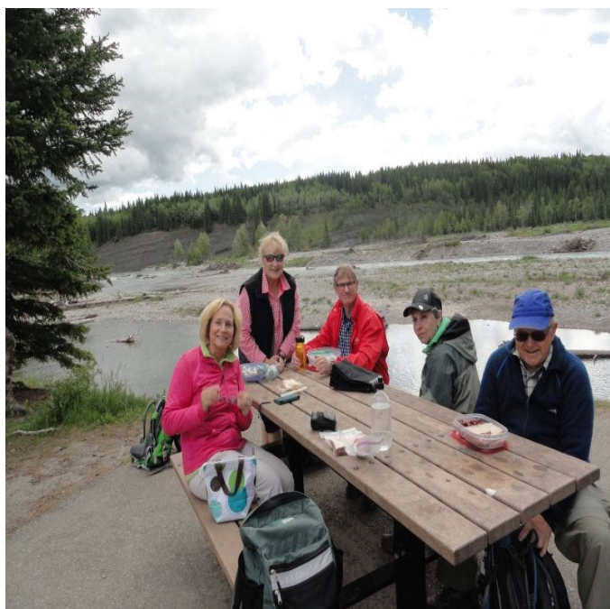
We lunched at what was Allen Bill Pond. There has been no restoration.