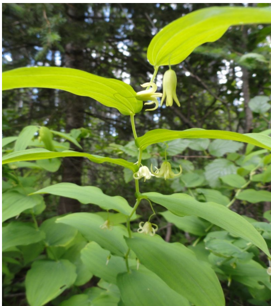
Clasp-leaved Twisted-Stalk hides its flowers under the leaf and you can see a twisted stalk.