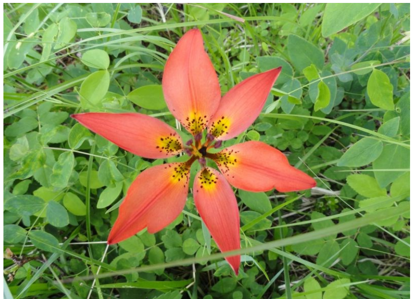
The flowers (at least 14 varieties) were the big feature of this hike as evidenced in this beautiful Wood Lily