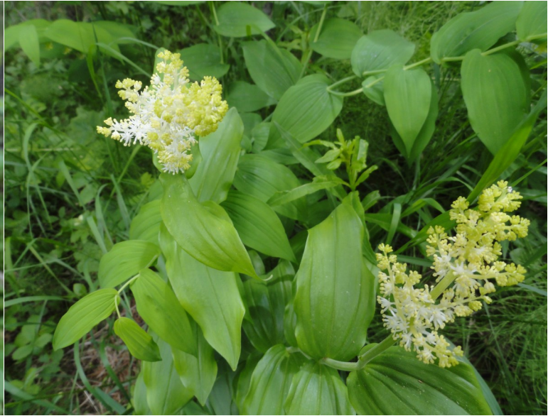
The False Solomon Seal is interesting to distinguish from Star-flowered or 3 leaved Solomon Seal.