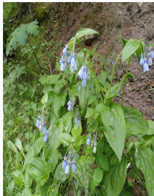
We saw lots of Tall Lungwort also called Tall Bluebells.