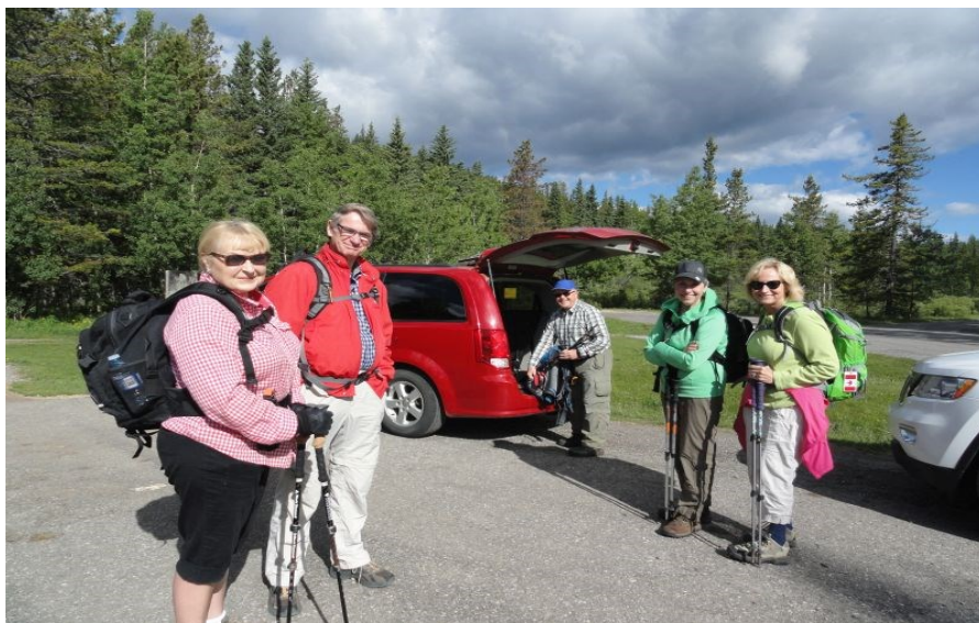
On our June 21st hike to Diamond-T Loop there was an ominous sky, but not a drop of rain fell on our six hikers.