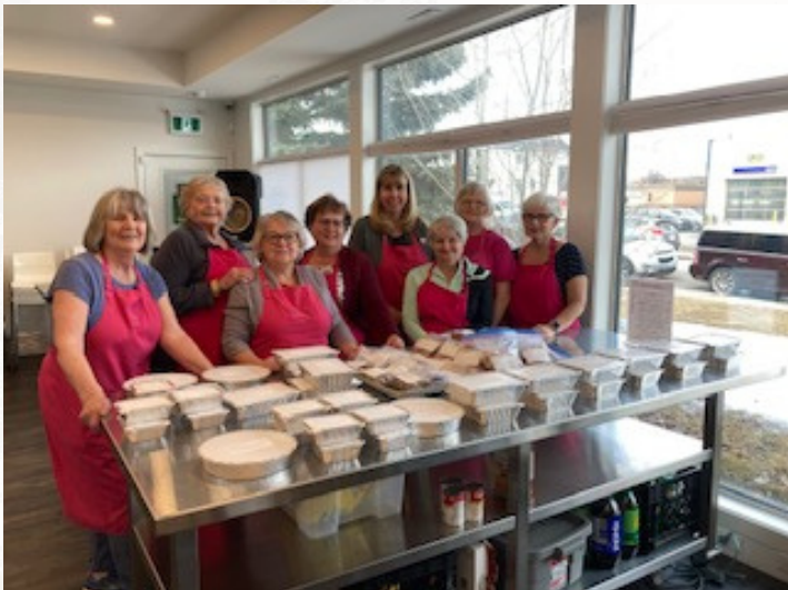
Our beautiful Rotary Partners