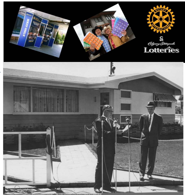
THE VERY FIRST DREAM HOME