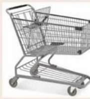
1.16 MB PNG

The shopping cart is the ultimate litmus test for whether a person is capable of self-governing.