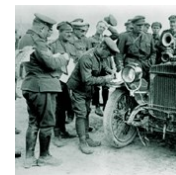
Soldiers voting 1917