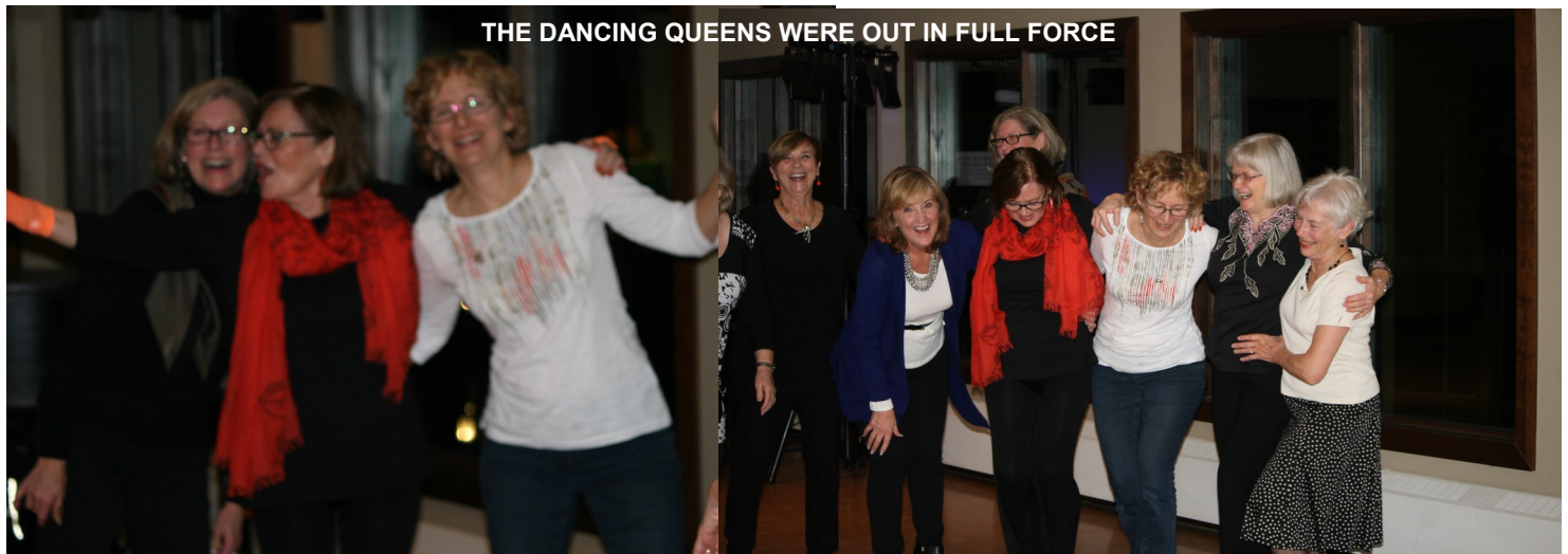
THE DANCING QUEENS WERE OUT IN FULL FORCE