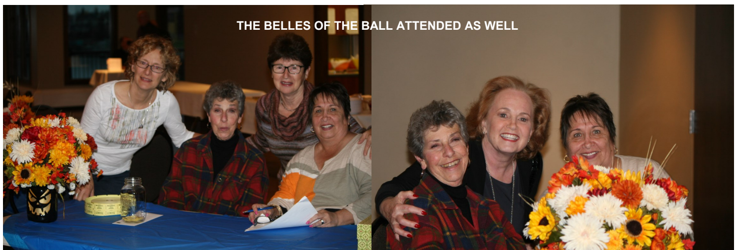
THE BELLES OF THE BALL ATTENDED AS WELL