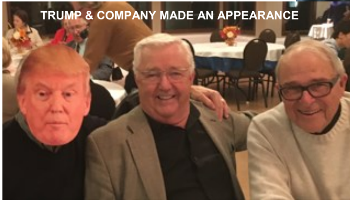
TRUMP & COMPANY MADE AN APPEARANCE