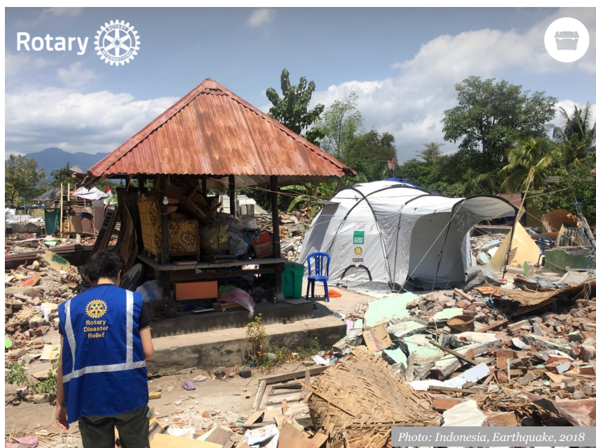
Photo: Indonesia, Earthquake, 2018

Those families also needed some other materials, so along with the ShelterKit we gave them a small green box with the pieces other aid they need. Most often that was a water filter, mosquito nets and a pair of LuminAID. The ShelterKits are used extensively because it is often the best solution for the family. It also makes the most of donor's money. A complete ShelterBox costs $1200, delivered but we can help a family with a ShelterKit and key pieces of aid for $300 – Four times as many families. That is pretty important as we strive to put a dent in the millions who need help each year.