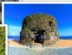
La Union, Beach