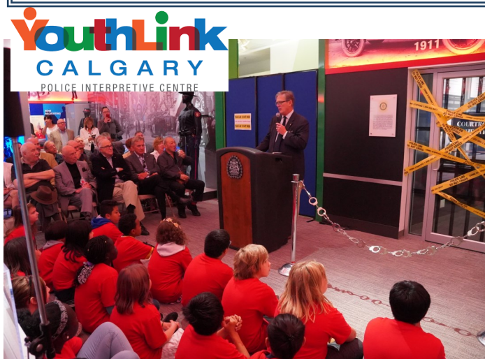
Sept 12 YouthLink Meeting - Click to view meeting