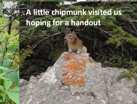
A little chipmunk visited us hoping for a handout