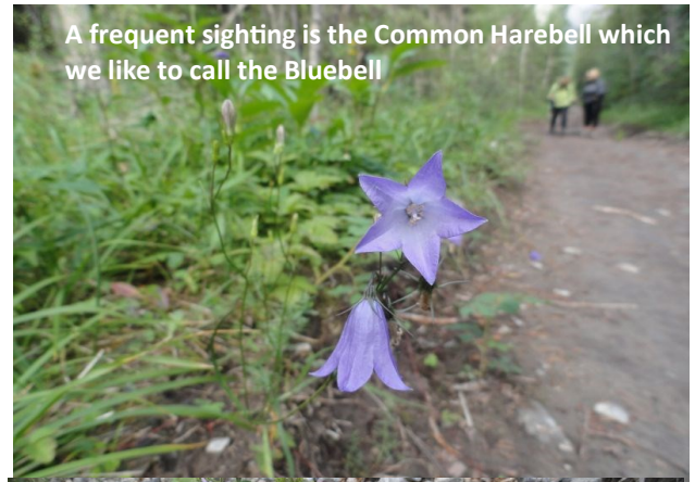
A frequent sighting is the Common Harebell which we like to call the Bluebell