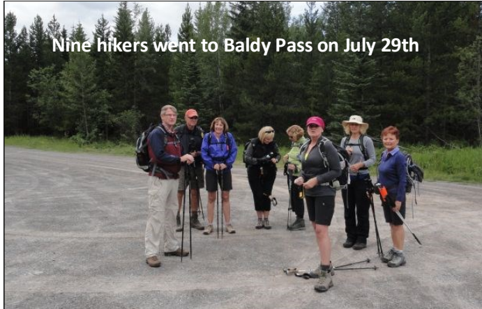
Nine hikers went to Baldy Pass on July 29th