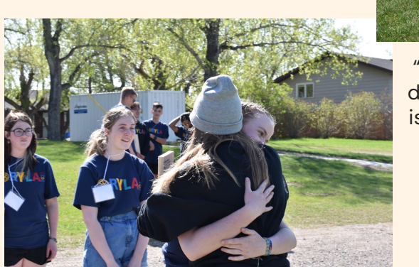
"Go. You'll create memories you'll never forget."

"RYLA is life changing and the moment you step in when you attend, you won't want to leave. It is such a journey in such limited days. But the friends you make, the lessons you learn and the growth you will take, will be the most amazing experience you will ever have in your life. The counsellors and people you meet will forever be your family in RYLA."