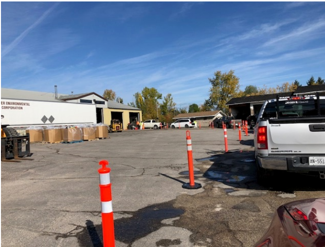
Hazardous Waste 2020