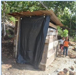
Toilet - Before