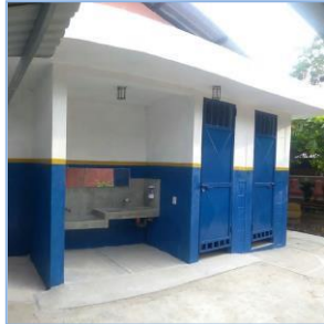
Washroom - After