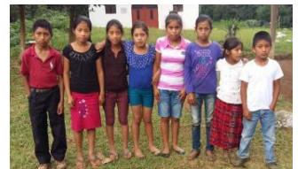
Students at San Luis School

If you would like more information, a Canadian Ripple Effect Program we would be pleased share more information with you, or make a presentation to your Rotary Club.