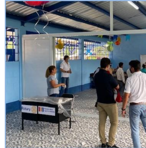
Classroom - After