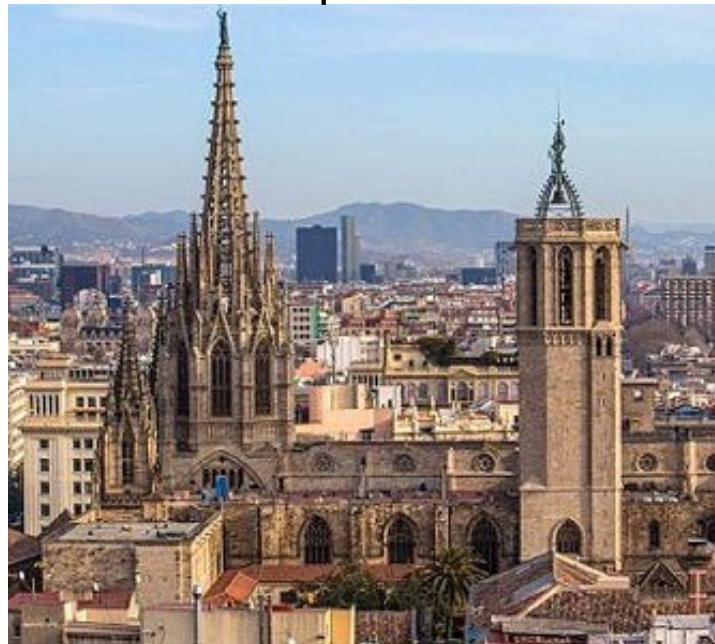
General view gothic quarter