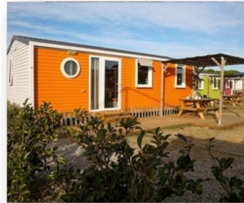
Mobile home 3 room 6 pax.