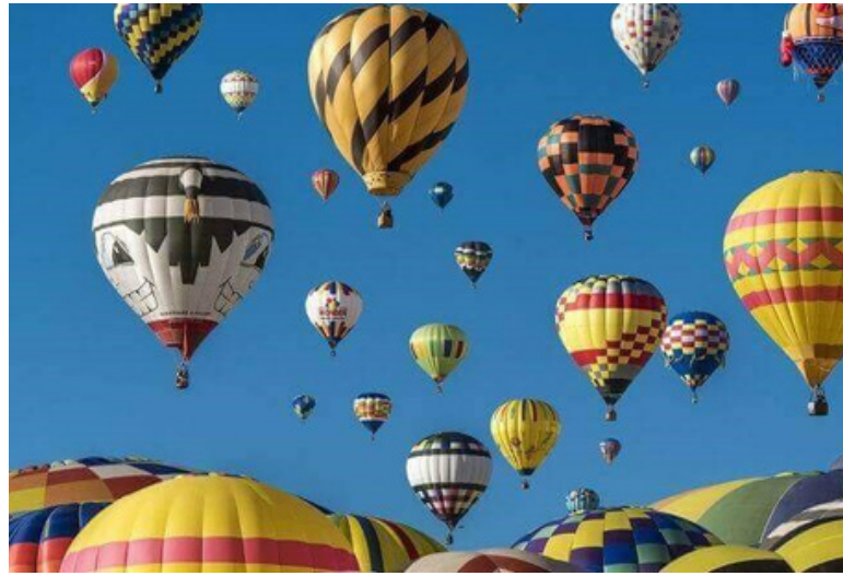
Balloon Festival Day

Dinner with the families, and meeting to see the European balloon festival night glow show.