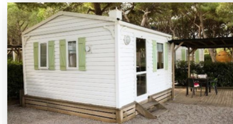
Mobile home 1 room 2 pax