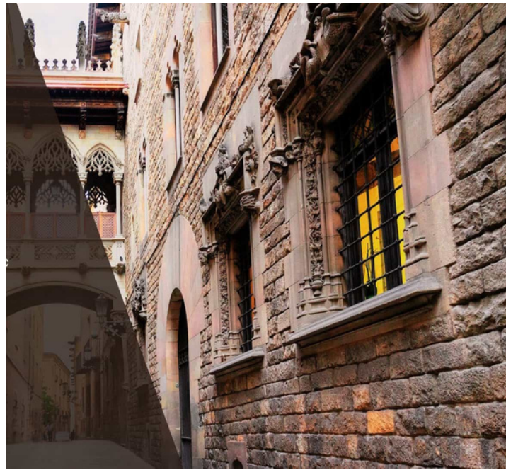
Gothic quarter street

Return by bus, to CAMPING TRES ESTRELLAS, and accommodation.