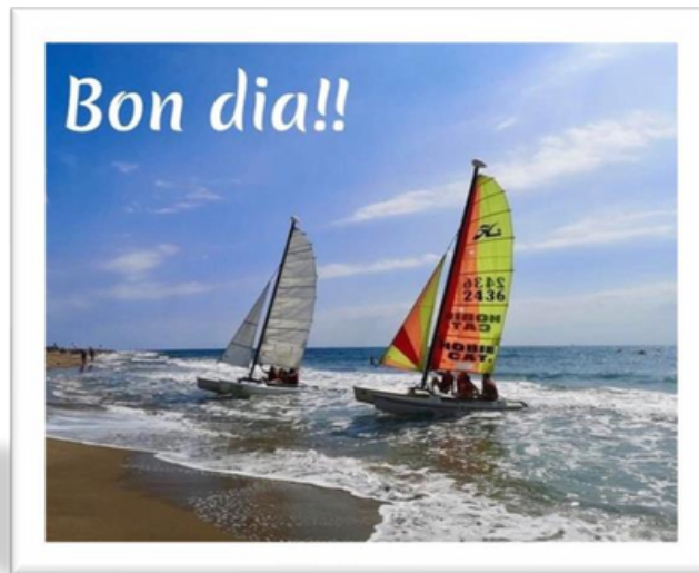
CASTELLDEFELS BEACHES FROM THE NAUTICAL CLUB

Return to Camping Tres Estrellas and accommodation.