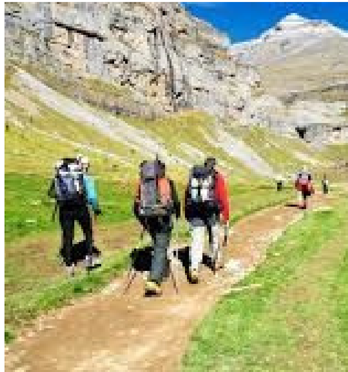
Mountains of Igualada

Meeting with the members of the Rotary club to have dinner in its site.