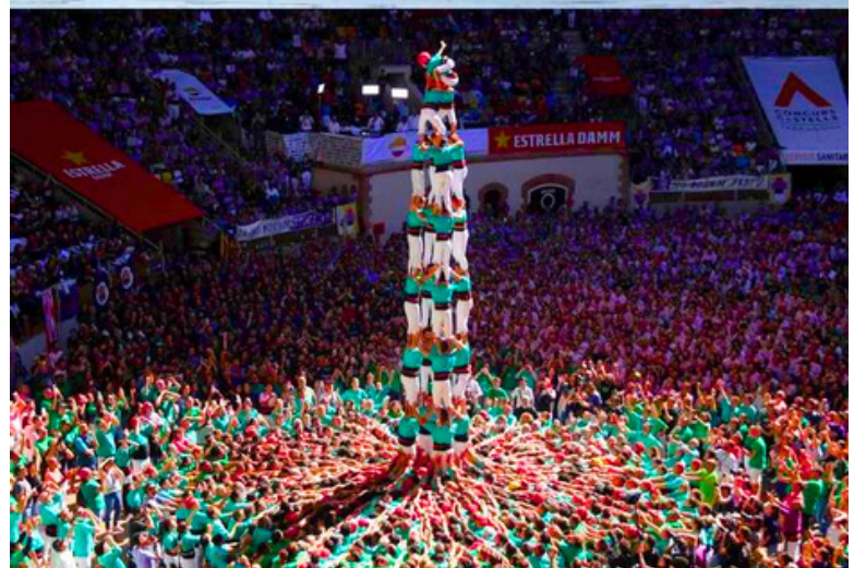
Colla castellers of Vilafranca