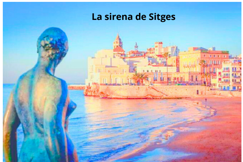
La sirena de Sitges

The Castellers de Vilafranca are a casteller group from Vilafranca del Penedès founded in 1948, the result of the great passion, tradition.