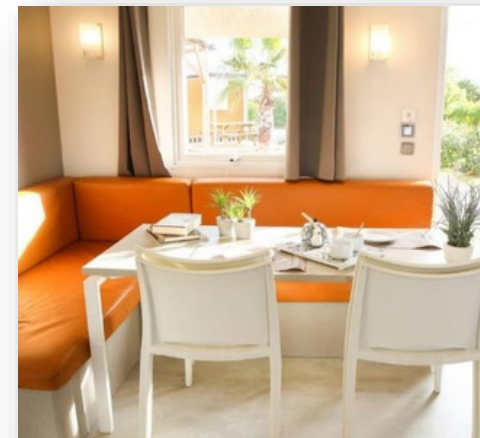
Mobile home large living room