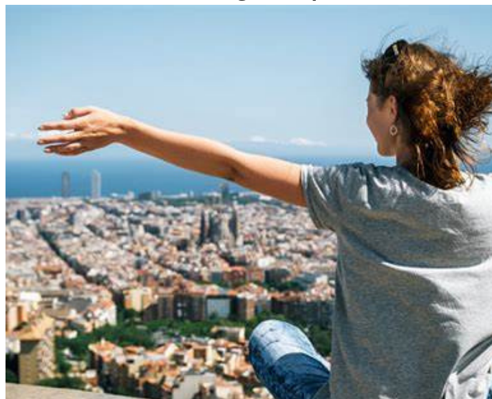
View of BARCELONA