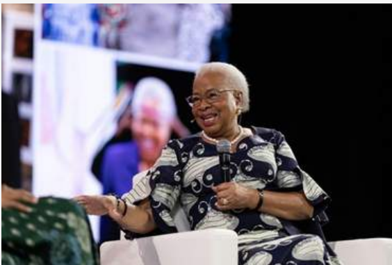
Humanitarian Graça Machel, co-founder of the global leadership group The Elders, addresses the opening general session at the 2024 Rotary International.

“Why is it we still have millions and millions of children out of school? Why have we [not] recognized that it’s their fundamental right?” asked Machel, a former first lady of both Mozambique and South Africa who is currently deputy chair of The Elders. “The question now is, are we all prepared to take the challenge and say to ourselves, ‘We have to eradicate illiteracy, particularly for girls?’”