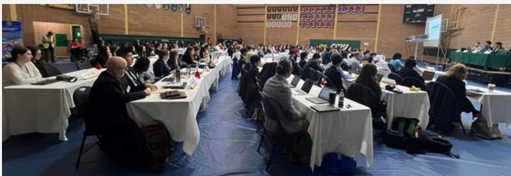
Opening Plenary Session of MUNA 2024

For the MUNA Organizing Committee, this year was particularly gratifying. First, the Organizing Committee decide to reach out to support rural and northern teams by waiving the registration fee for teams from remote and First Nations communities. As a result, we had our first Indigenous team from Cranberry Portage. We also had delegations from rural and northern communities like Flin Flon, Creighton SK, Kenora ON, Neepawa and Dauphin.