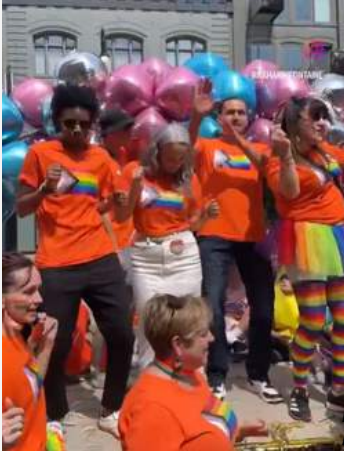
Premier of Manitoba, Wab Kinew, Deputy Premier, Uzoma Asagwara, joining the Pride parade stage dance