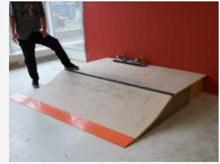
Ramps being constructed at Pitikwe Skate Park with our Rotary donation.