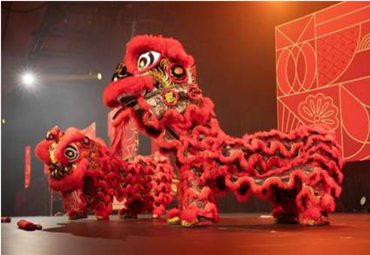
The He Xin Lion & Dragon Arts Troupe performs at the opening general session of the Rotary International Convention in Singapore.