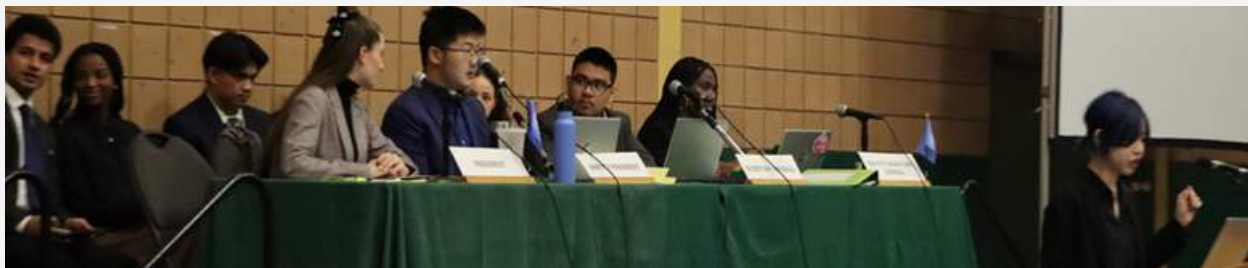
MUNA Assembly Leaders