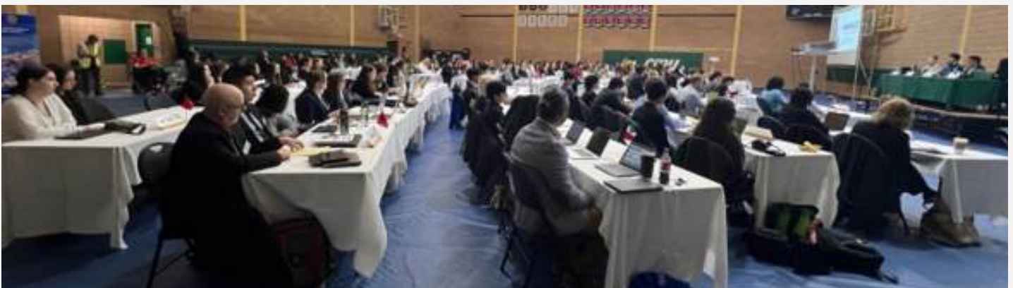
Opening Plenary Session of MUNA 2024

Once again, the MUNA Organizing Committee will be offering First Nations and remote communities free registration – saving sending communities as much as $750. Last year saw our first Indigenous team, in many years, join MUNA from Frontier School Division. We also had delegations from rural and northern communities like Flin Flon, Creighton SK, Kenora ON, Neepawa and Dauphin.