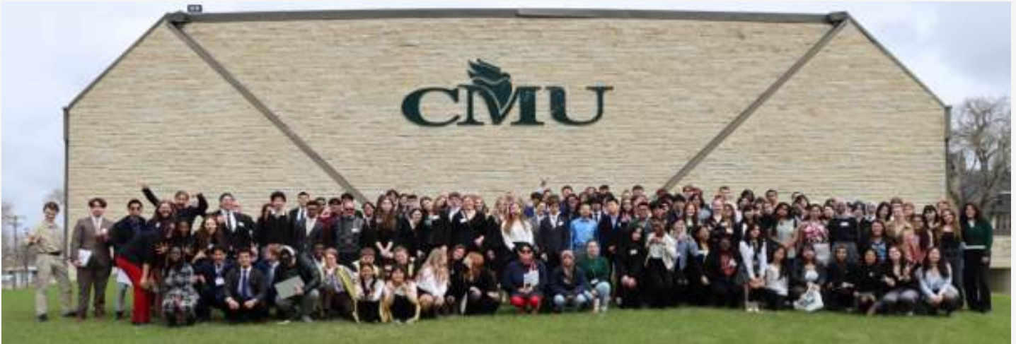
MUNA 2024 Delegates

High school students from across Manitoba, Saskatchewan, Northwestern Ontario will spend time discussing this year's theme "adaptation and shared responsibility" in response to two resolutions asking how the world should respond to growing conflict and food shortages.