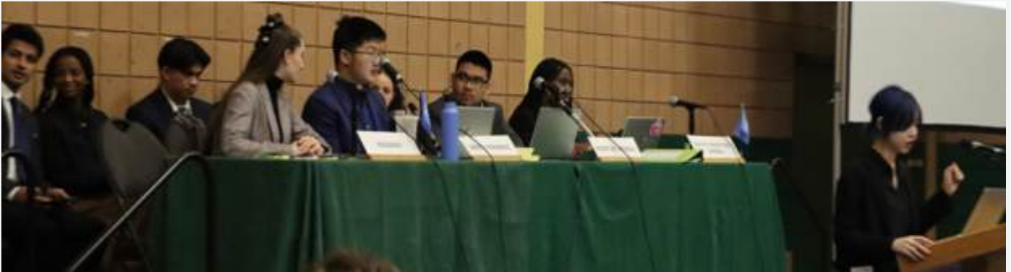
Led By and For Young People Across District 5550

The work of creating solutions to the problems posed in the resolutions is all done by the delegates themselves. The Assembly, Committees and Break-out Group meetings are all led by student chairs and facilitators. Over the next few weeks, new leaders will be chosen from delegations from across the province to fill leadership roles. From the MUNA President and Secretary General to small group facilitators, the leadership will come from among these young delegates and organizers.