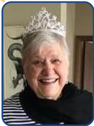
SUBMITTED BY ERNIE SHEWCHUK