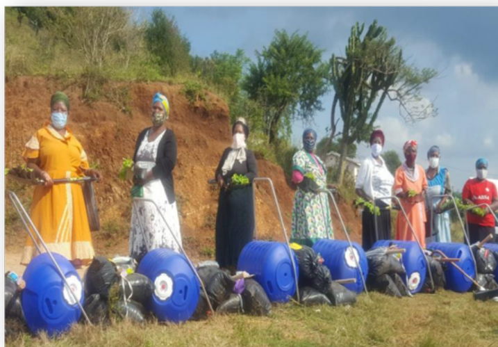
BENEFICIARIES OF SURVIVAL GARDEN KITS IN THE VALLEY OF 1000 HILLS, KWAZULU-NATAL, MAY, 2021