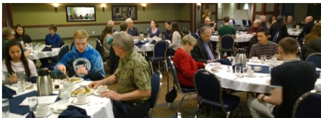
The room was crowded as we welcomed