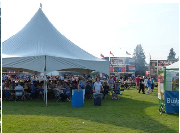
RibFest 2014 Pictures