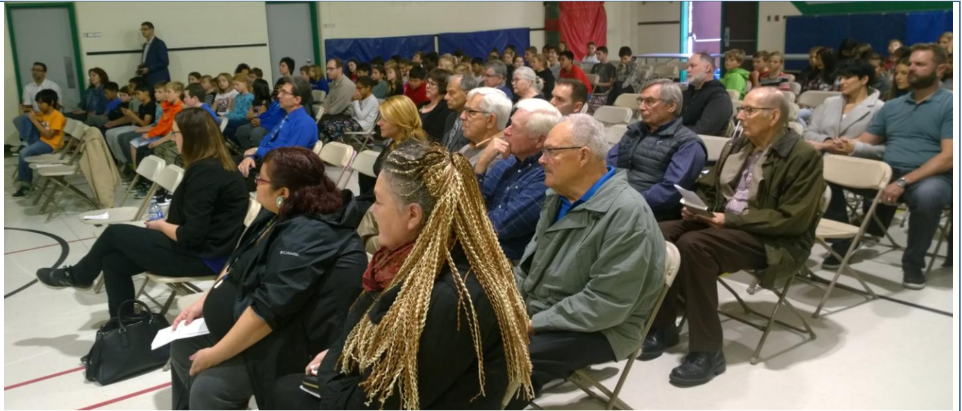
More than 100 St. Anne students and teachers joined Nutana Rotarians for the ceremony.