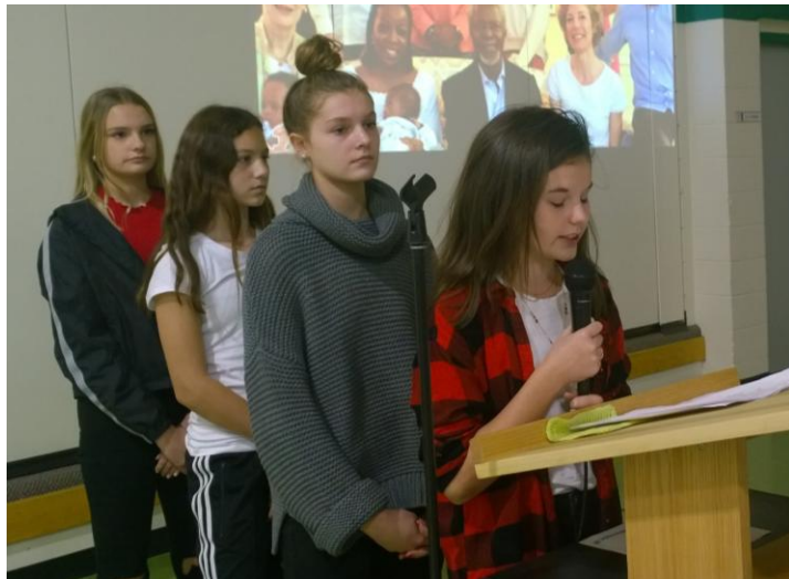
Grade 8 students made a presentation about Kofi Annan and why he was awarded the Nobel Peace Prize.