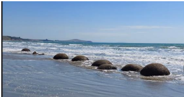
Murachi boulders and Milford Sound