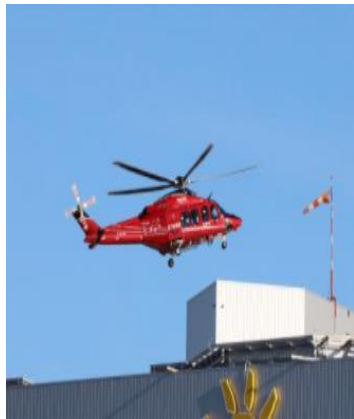
Helicopter Landing Pad. The helipad is on the roof of the Hospital. There is a dedicated direct elevator to the emergency room.

For more information, visit their website: https://pattisonchildrens.ca/