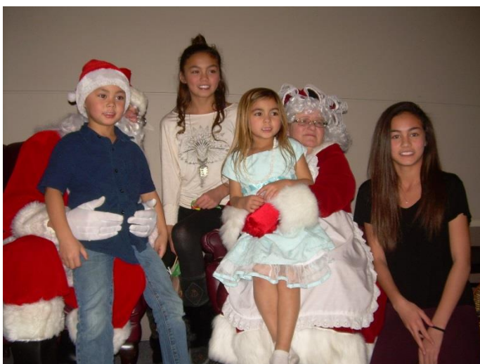
The Pankewich grandchildren pose with Santa