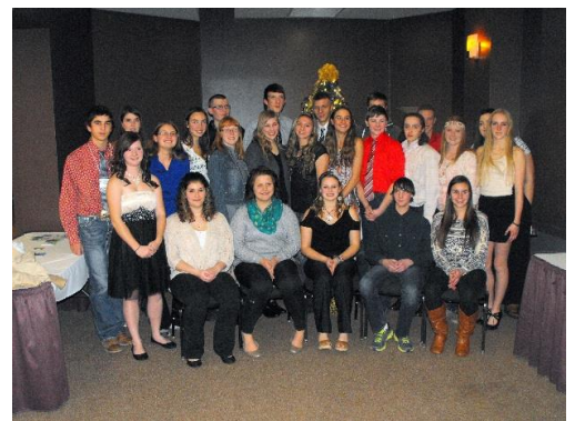
Above - A in A 2014

It is great to have witnessed the support for this initiative over the past month and a tip of the hat to the members who stepped forward to provide the all-important leadership. Please consider where you are able to add your support to a piece of this program, for there are a host of opportunities that will be detailed in the coming weeks – you will be glad and the Committee will be thankful for your effort.