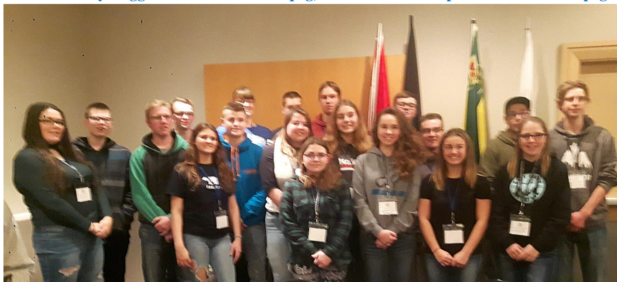
The 2018 Adventures in Agriculture students.

Sponsor RC of Brandon Sponsor RC of Brooks Sponsor RC of Brooks Sponsor RC of Dryden Sponsor RC of Dryden Sponsor Rotary Club of Innisfail Sponsor RC Club of Innisfail Sponsor RC of Innisfail Sponsor RC of Lacombe Sponsor RC of Lacombe Sponsor RC of Lethbridge East Sponsor RC of Neepawa Sponsor RC of Portage la Prairie Sponsor RC of Regina Eastview Sponsor RC of Regina Oskaya Sponsor RC of Regina Sponsor RC of Westlock Sponsor RC of Winnipeg East AM Sponsor RC of Winnipeg-Assiniboine