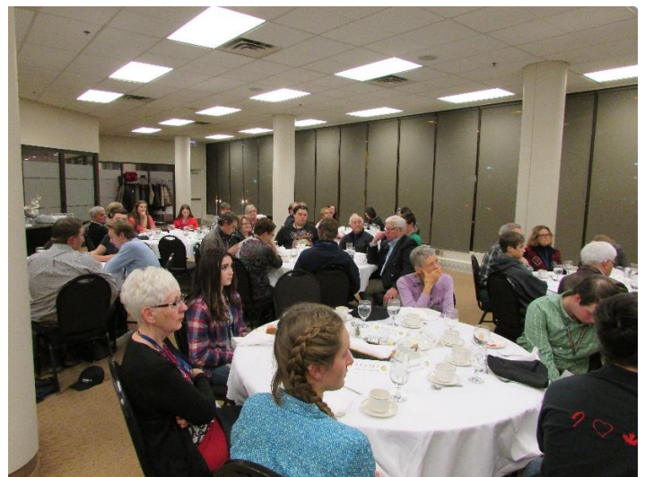
The Wednesday night dinner--meeting the home hosts