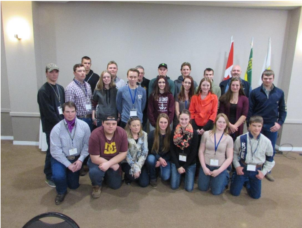
The 2016 Adventures in Agriculture students

ONE MORE THANK YOU—TO THE HOME HOSTS, DRIVERS AND ALL VOLUNTEERS—IT WOULD NOT HAPPEN WITHOUT YOU!!!