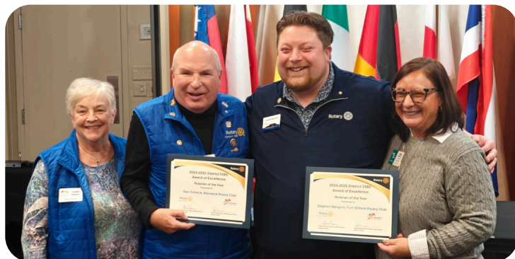
District 5580 Rotarian of the Year