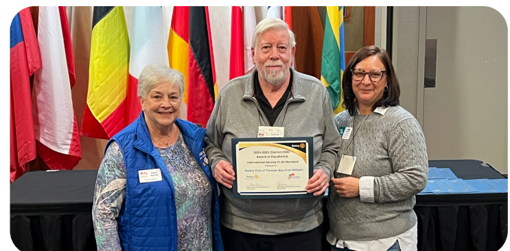
Fundraising (31-60 Members)