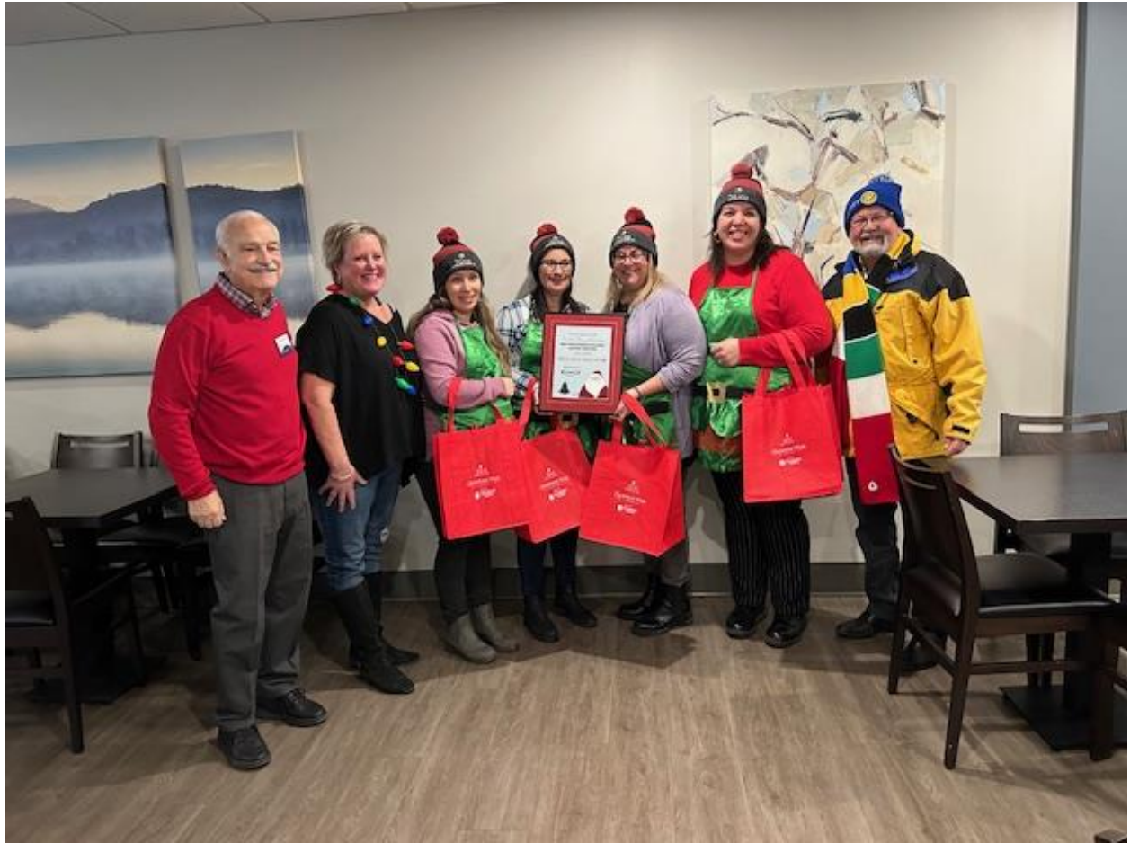
The winners from the Santa Claus parade were presented with awards.