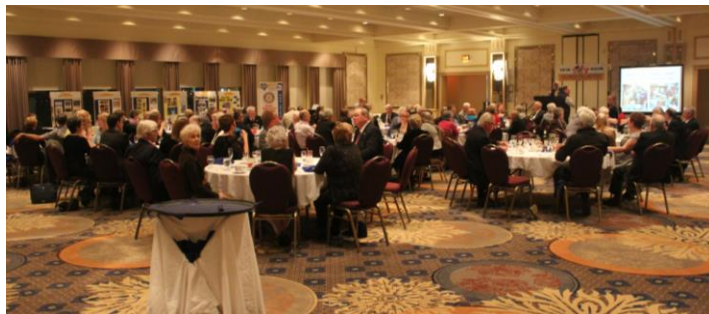
100 Rotarians and friends assembled in the Valhalla Ballroom

100 Rotarians and friends attended the event on Friday and here are some photographic highlights: