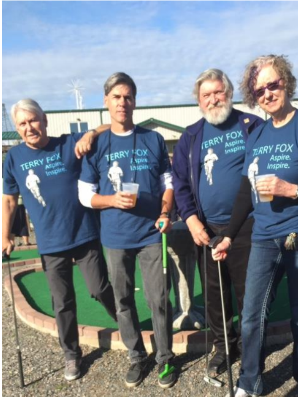
Here's one of our intrepid teams sizing up the course resplendent in this year's Terry Fox Run shirts.