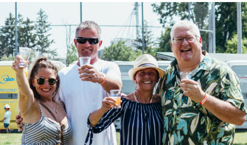
(Brews & Food Festival Guests - Photo courtesy of Kelsey Garner)

With your help and help from the community we can fund the many projects and requests you will read about in this letter. We are again asking for your support so we can continue our efforts to enhance life in our local and international communities.