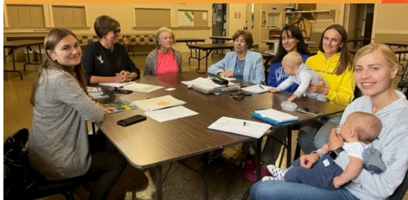
(Introductory and advanced ESL classes for Ukrainian families)