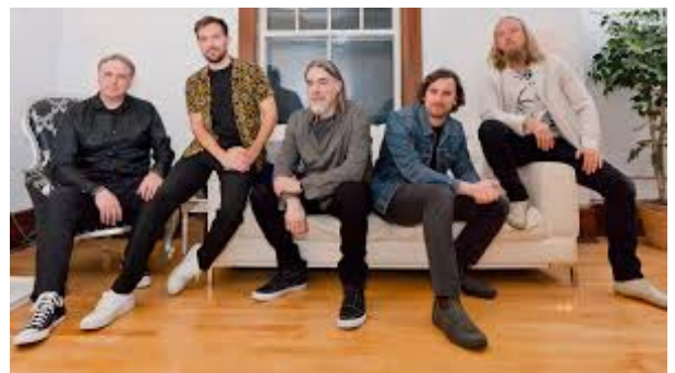
Downie Street Collective