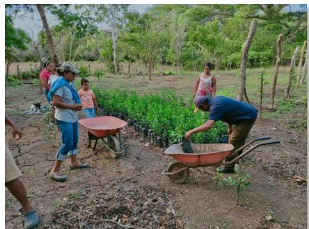
Families planting trees from homegrown seedlings