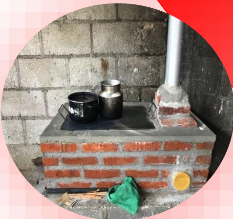
Eco-friendly Justa Stove