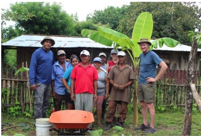
COMMIT Team with local farmers in Nandarola

For further information and to donate please contact: davidknoppert@sympatico.ca