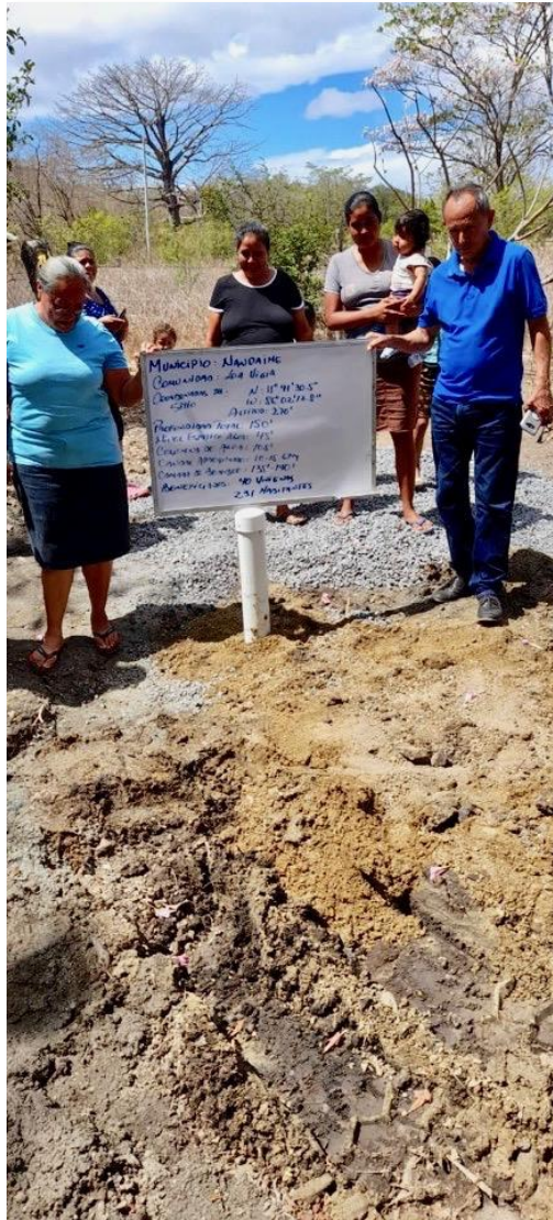
Drilling started in village of la Viga