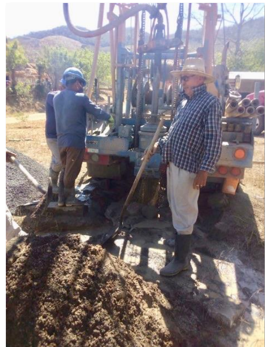
Drilling started in village of El Javillo