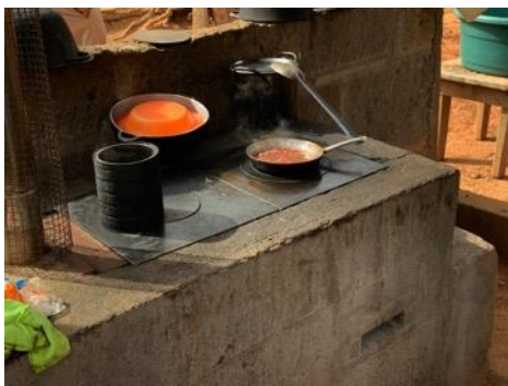
Stove installed as part of the pilot project in Nandarola