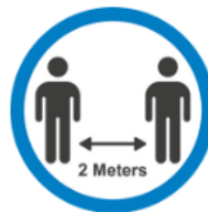
Maintain Physical Distance