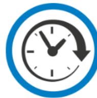
Plan Ahead to Avoid Frequent Trips into the Community