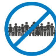
Avoid Busy Locations