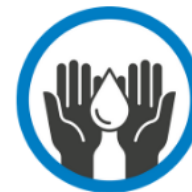
Wash Your Hands Frequently