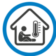
Stay Home if You Are Sick