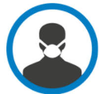
When Appropriate, Wear a Mask