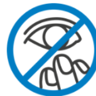
Don't Touch Your Face