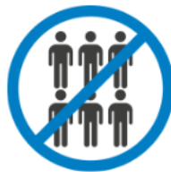
Do Not Gather in Groups Larger than 5