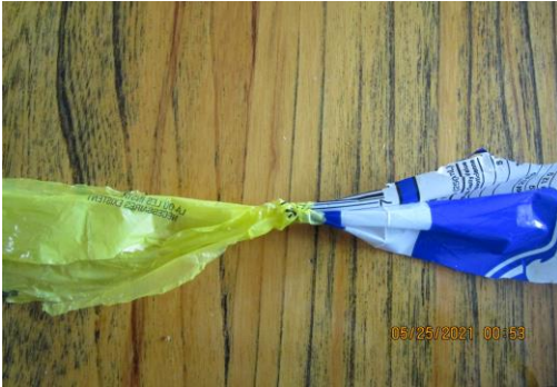
make one strip, before crocheting.

Pull one strip through another strip to tie them together as one