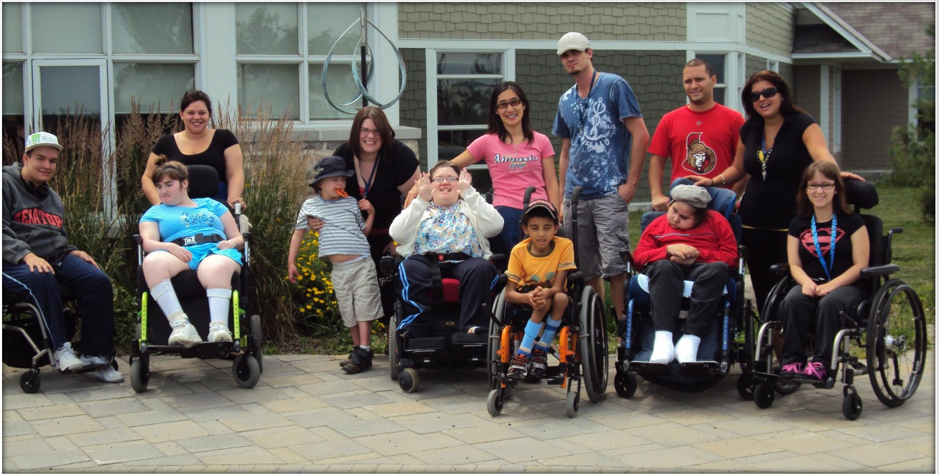
Clients and Staff in front of the Leitrim Campus