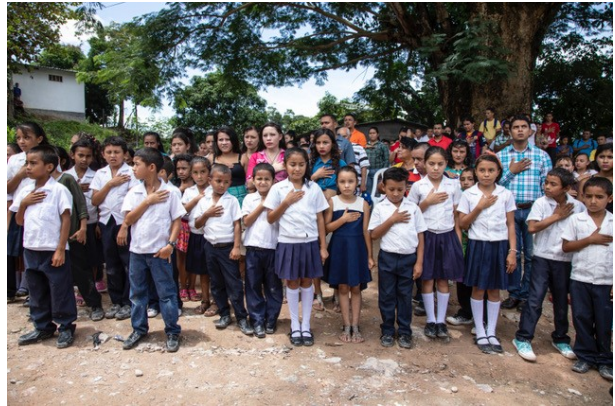
The Children Classroom Interior & Group Shot