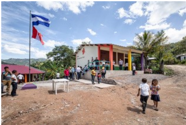
Canadian Flag flying proudly