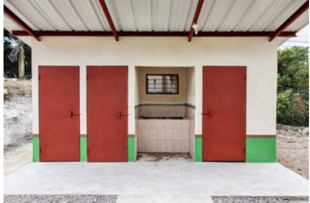
The New Structures Classrooms & Washroom Facilities