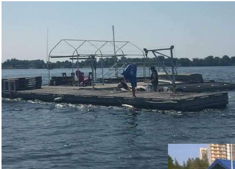
Towing of the Docks