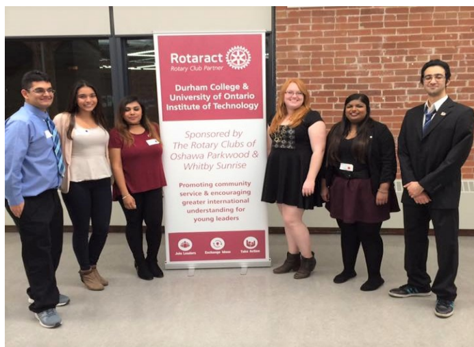
Rotaract Club of Durham College – University of Ontario Institute and Technology Executive for 2016-17