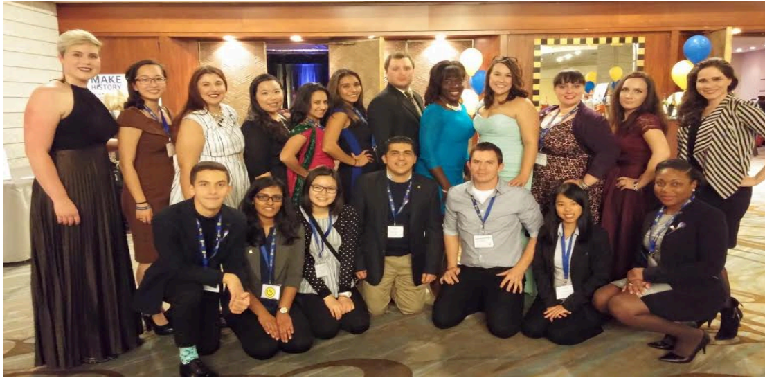
Here is a photo of some of the Rotaractors from the District 7070 Rotaract Clubs at the Rotary District Conference Oct 23-25, 2015 at the Westin Harbour Castle.