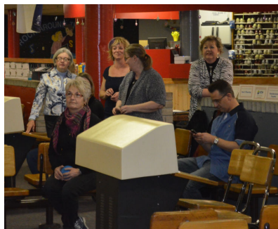
Some of the competition.