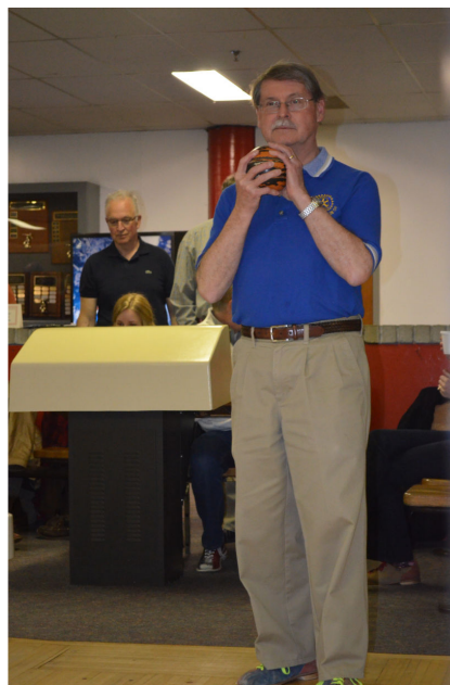
I must remember that addressing the alley does not start, "Your Honour!"