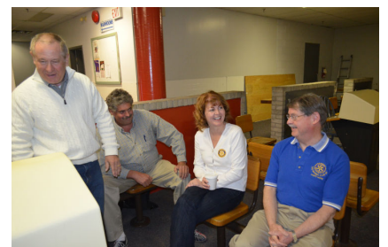
Yes, we are having fun, really !