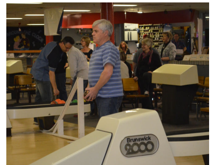
Should I use the one hand twist or the two hand toss?