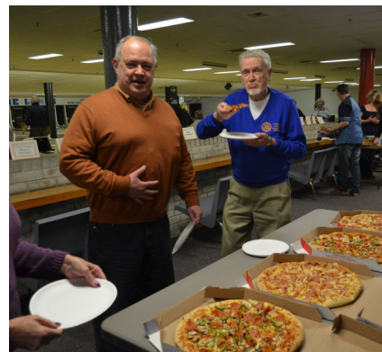
Bowling? I thought it was a pizza contest!