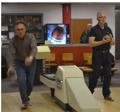
Action & Contemplation