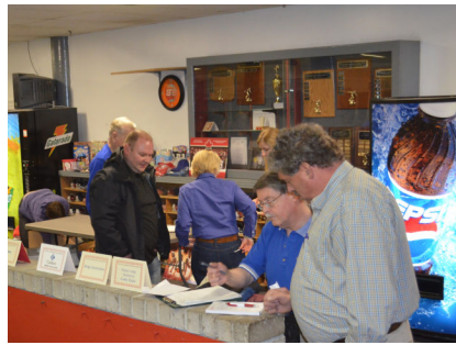
Who do we put in fourth?