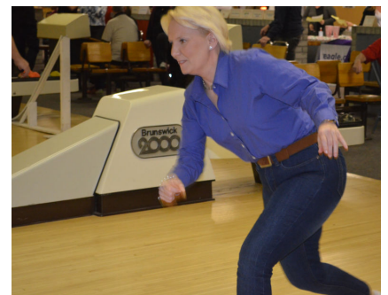
Yes, this is a good bowl!!