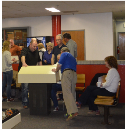
How many Rotarians does it take to change the electronic score?