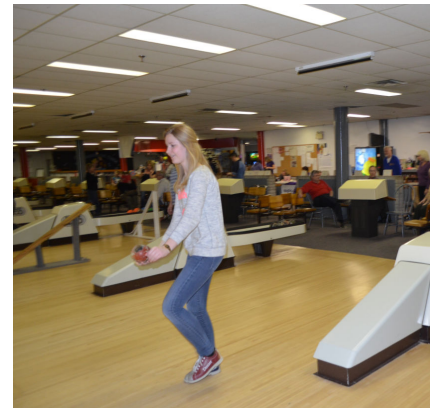
Really? I have to keep the ball between the gutters?