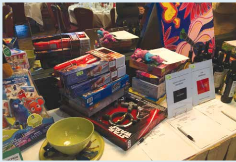
Some wonderful silent auction items at last year's party.

Be sure to attend this final meeting of the year to enjoy the fellowship and fine Holiday Buffet at the Royal York. We will have a silent auction and lucky draws, with all the money raised given to "The Stop", a local downtown Toronto Charity who have been using good food to bring people together for over 35 years. Take all those unused luncheon tickets in your top desk drawer and bring your family, friends and business associates. It will be a fun time.