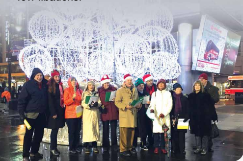
Last year's Christmas Carolers