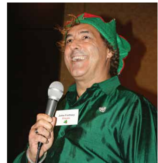
A happy Elf

Invited guests are from: Easter Seals Ontario, CNIB, Bob Rumball Centre for the Deaf, Holland Bloorview Kids Rehabilitation Hospital, Gilda's Club of Greater Toronto and Starlight Foundation. We expect 650+ invited children and their families.