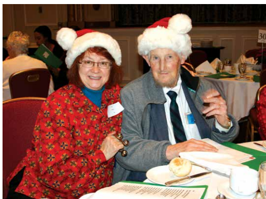
2015 seniors enjoying the party

This program could not happen without the team from the Senior Citizens Committee, Toronto Police Services who provide a bus, WheelTrans who bring in so many of the more vulnerable and of course the team of Rotarian Drivers who pick up large numbers of our guests. Rotarians join the seniors at the table and all go home with a lovely bag of goodies. Good memories.