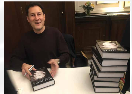
Steve Paikin signing books