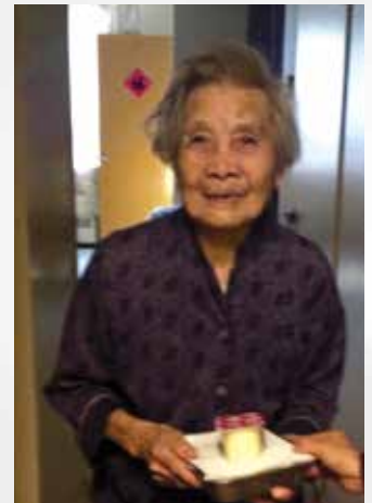
One of our Seniors...Over 100 Years old!