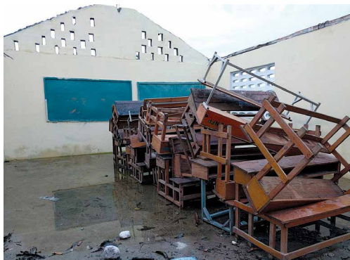
Damage at a Haitian school