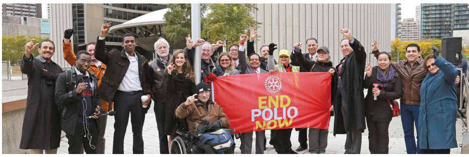
Flag Raising Ceremony at Toronto City Hall on Monday

Rotary International made a commitment in 1986 to eliminate polio worldwide. We will be there until the end. Your donations made to www.conquerpolio.org will be matched by the federal government and the Melinda & Bill Gates Foundation.